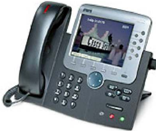
Figure 1. Cisco Unified IP Phone 7971G-GE

The Cisco Unified Communications system of voice and IP Communications products and applications helps organizations communicate more effectively—by helping them streamline business processes, reach the right resource the first time, and enhance productivity. The Cisco Unified Communications portfolio is an integral part of the Cisco Business Communications Solution—an integrated solution for organizations of all sizes that also includes network infrastructure, security, and network management products; wireless connectivity; and a lifecycle services approach, along with flexible deployment and outsourced management options, end-user and partner financing packages, and third-party communications applications.