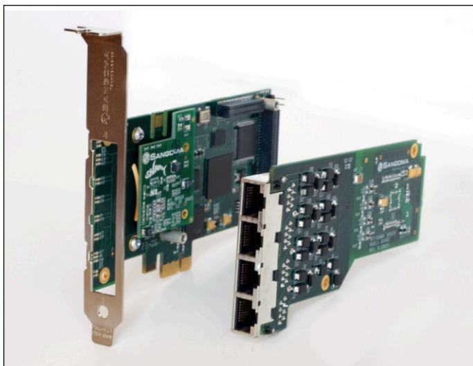
A104 PCI Express disassembled

The A104 is the quad port version of Sangoma’s family of Advanced, Flexible Telecommunications (AFT) hardware designed for optimum support of voice and data over T1, E1 and J1.